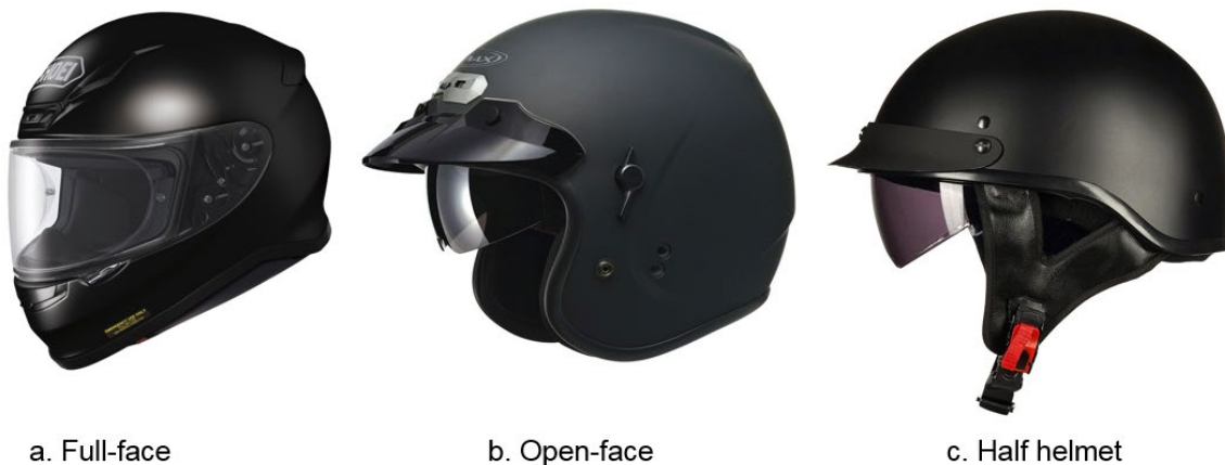
Figure 2.2: Helmet Coverage Types

Almost every rider in the 1,053 observations was wearing a helmet (95% in the crash group). Furthermore “Full-Facial Coverage with Integral Chin Bar and Face Shield” was the most frequently observed category for crash passengers and for control passengers. Regarding motorcycle helmet coverage, compared to the control group, riders with helmet coverage type 1 (USDOT compliant helmets with partial coverage, least intrusive covering only the top half of the cranium) were less frequent in the injury crash group. Likewise, riders with acceptable helmet fit were also less frequent in the injury crash group. The finding that riders with partial helmet coverage are less frequent in crash group is intuitive; as full coverage helmets may interfere with the rider’s hearing and vision capabilities, and thus may increase probability of crash. However, note that helmets are pivotal in reducing head injuries, given a crash (Brandt et al. 2002). Regarding overall helmet use, 100% of the control group riders were wearing helmets at the time of the interview. The helmet use among crash group riders was also high, i.e., riders in only 4 crashes were not wearing a helmet at the time of crash. Typically there are various styles of helmets which afford different protection: full-face, open-face, and half helmet (Figure 2.2). Riders with an acceptable helmet fit were less frequent in the crash group compared to control group.