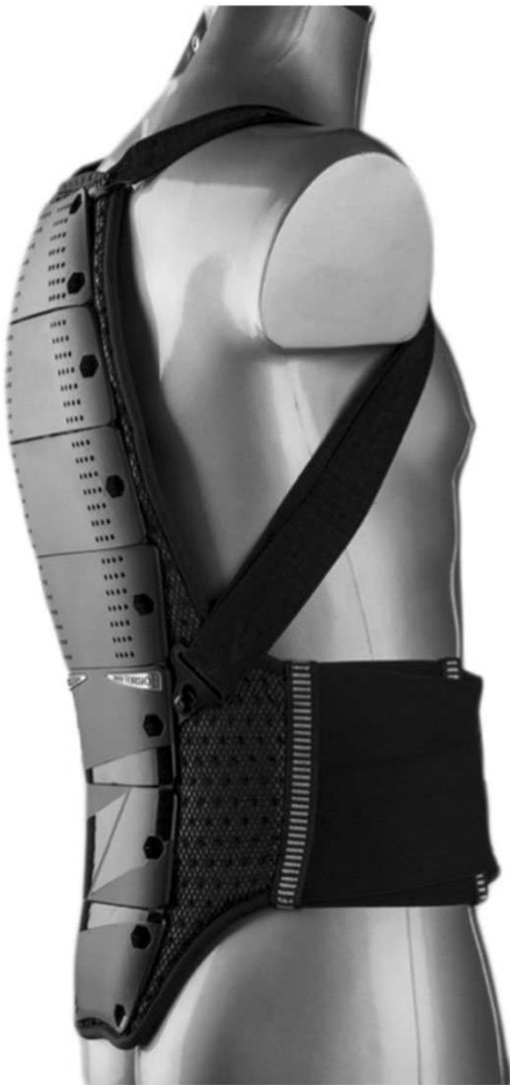
Figure 2. Hard-Shell Back Protector Device for the whole spinal column (cervical, thoracic, lumbar and sacral sections) worn on manikin. EN1621-2/12 Standard; CE2 certification.

BPD. Data analysis was carried out using Stata/SE 12.1 (StataCorp, College Station, TX, USA).