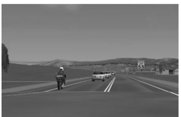
Fig. 2. Driver's view of the motorcycle in the left-of-lane position (top) and right-of-lane position (bottom).

Because we found no interaction between vehicle type and gap size, we collapsed data across gap size, and performed