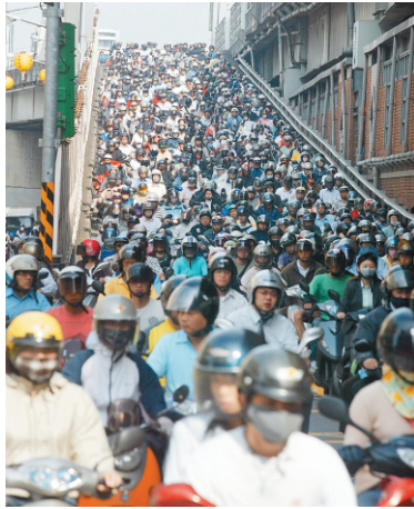
FIGURE 1: Rush hour motorcycle traffic in Taipei.

injuries, controversy still exists on the effect of helmet on CSI [7–10]. Crompton et al. (2011) utilized a large-scale study and concluded that motorcycle riders wearing helmets are less likely to suffer from CSI [11]. However, Crompton's study was not specific for HI patients and also admitted that the lack of helmet-type data was one of the limitations.