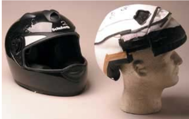
The Schuberth S1 uses five separate foam parts glued together to meet the ECE standard.

Problem is, nobody wants a 2-foot-wide helmet, though it might come in handy if you were auditioning for a Jack in the Box commercial. So helmet designers have pared down the thickness of the foam, using denser, stiffer EPS to make up the difference. This increases the G-loading on your brain in a crash, of course. And the fine points of how many Gs a helmet transmits to the head, for how long, and in what kind of a crash, are the variables that make the helmet-standard debate so gosh darn fun.