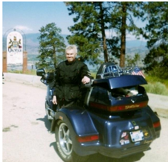
Eastern British Columbia on the '88 GL1500, 2002

In 1997 I bought a 1988 GL1500 with 22,000 miles and a Lehman conversion kit and had both shipped to my house in Tacoma, WA. At that time, you could still install the conversion yourself. In the next 12 years I piled on the miles - 172,000 on the GL after conversion.