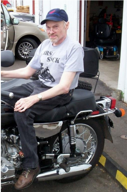
At the dealership in Salem, OR thinking about test Riding Ural Tourist – 2008

Burgman 400. The Burgman was a terrific way to close out my riding career, back on 2 wheels. I enjoyed the Suzuki for a year and a half and 3,000 miles.