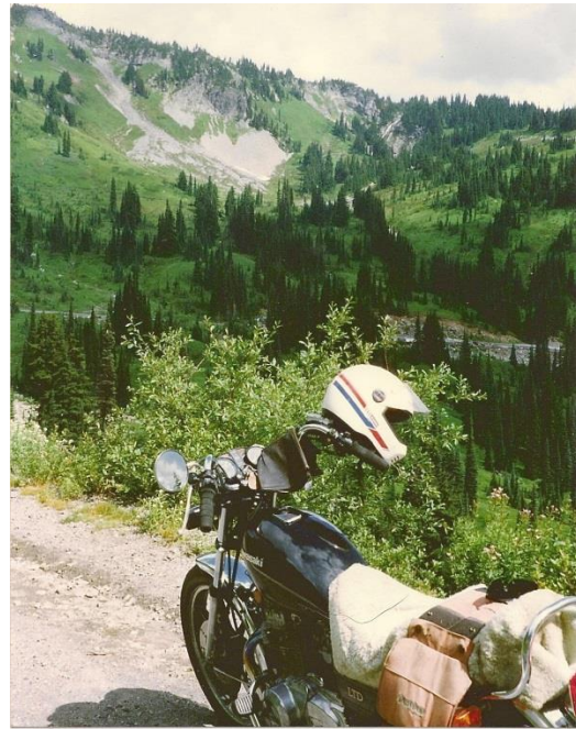
East of Paradise, Mt. Rainier, 1988

In 1989 I bought a second, better-condition, low-mileage 1981 KZ440LTD and used the first one for a parts bike. The 440 series was easy to modify for my needs because of its design, so I stuck with them. I put 45,000 miles on my 2nd KZ440, again with no troubles. I can't say the same for my body during that time. From 1983 to 1993, I had 3 more replacement surgeries for a total of 6 body-carpenter procedures. The cement they used to keep the implant in the femur would deteriorate after 2-3 years. In '89 and in '93 I had cement-less implants "installed" and haven't had a need for replacements since.