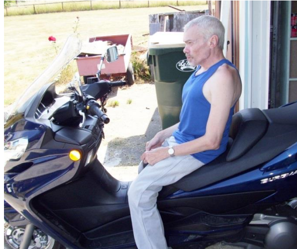
My last bike – a 2007 Suzuki Burgman 400 purchased in 2009

With the collagen gene being defective, it also affects certain muscle fibers. I could not build up my muscles for strength, so as they got weaker, my physical ability to safely ride and control my motorcycle was deteriorating. I made the toughest decision ever and stopped riding in the summer of 2010. It was becoming more and more difficult to get my gear on because of the reduced range-of-motion I was experiencing in all my other joints. If I could not wear the proper gear and be safe with my riding skills, I knew what I had to do.