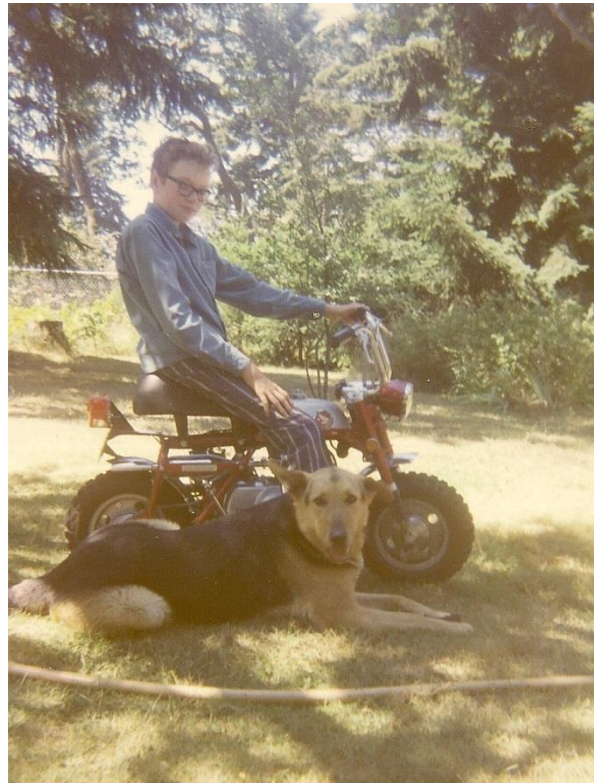
Me on my Z50 - 1968

My condition started affecting me noticeably when I was about 12, so I was fortunate to have had those amazing experiences with him on the Indian before I couldn't straddle a motorcycle seat anymore. My spine started to curve and I could not stand up straight. It got to the point at age 14 that my spine was fused along with both hips. I couldn't even get my legs apart enough to sit on a motorcycle seat.