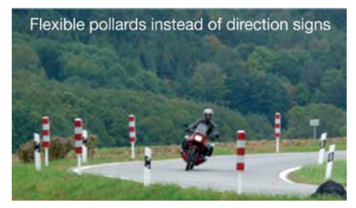
Figure 8. German example of curve delineation with flexible post delineators.

Pavement markings can pose a threat to motorcyclists because of the change in friction at the transition from pavement to marking material. This is particularly true for large pavement marking symbols, such as arrows, text, and crosswalk markings. One practice observed in