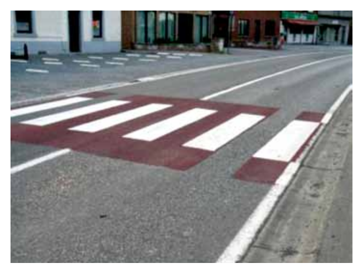
Figure 10. Gap left in crosswalk marking material for motorcyclist to pass through in Belgium.

Pavement marking material choices and application practices are discussed in the Belgian Road Safety Institute document on motorcycle considerations for motorcycles. It recommends textured pavement markings by troweling or using antiskid particles mixed in with retroreflective elements.