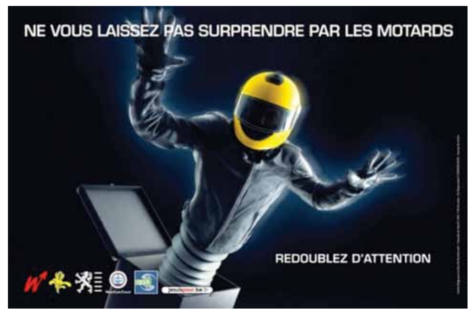
Figure 20. Belgian traffic safety poster: "Do not let yourself be surprised by the bikers. Be doubly careful."

Laws on licensing age, power of motorcycle engine allowed with different license classes, and training requirements varied considerably from country to country.