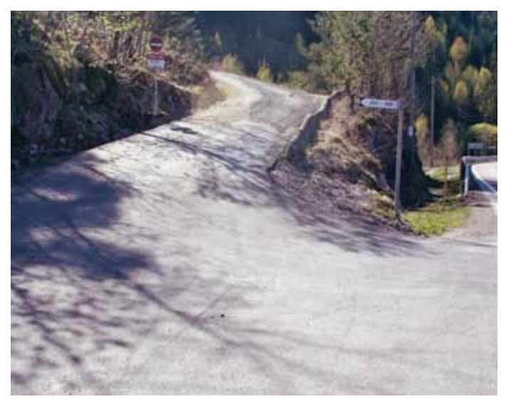
Figure 6. After: 5 meters of driveway paved with asphalt at intersection with paved roadway.