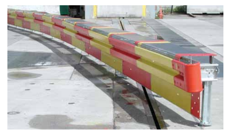
Figure 15. Above: System Euskirchen Plus guardrail, which includes a bottom skirting and a cap along the top; right photo shows alternate cap design.

In 2008, the Norwegian Public Roads Administration rebuilt a 15-km road segment outside Oslo to provide a model of safety improvements for motorcyclists. The Vision Zero Motorcycle Road includes guardrails with motorcycle barriers, redesigned side terrains, consolidated signposts, larger clear zones, and improved sight distance around curves. Most of the improvements were general, low-cost safety improvements that would benefit all road users. The motorcycle barrier (see figures 18 and 19 on next page for before-and-after photos) was the only