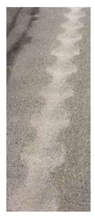
Figure 12. Centerline rumble strips with sinusoidal cut pattern to eliminate sharp edges that pose hazards to motorcyclists.

The team learned that the agencies it visited use the same roadway design philosophy as the United States, with a desire for design consistency within functional class and harmonization of posted speeds with design characteristics. In Europe, as in the United States, specific vehicle sizes and driver eye heights are assumed for roadway design values. The lack of a design motorcycle and rider was noted in several countries visited. Despite these data gaps, federal transportation agencies, European Unionsponsored coalitions, manufacturers' groups, and research institutes have developed the various roadway design guidelines described in this chapter.