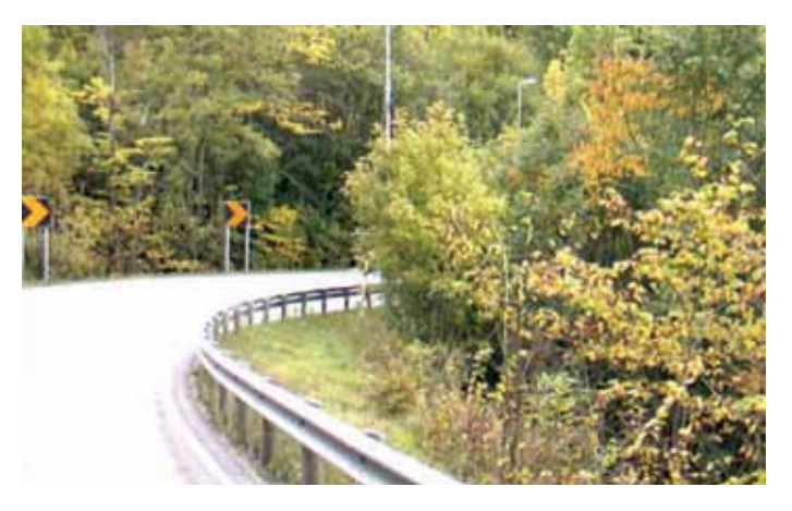
Figure 18. Norwegian Vision Zero Motorcycle Road before treatment.