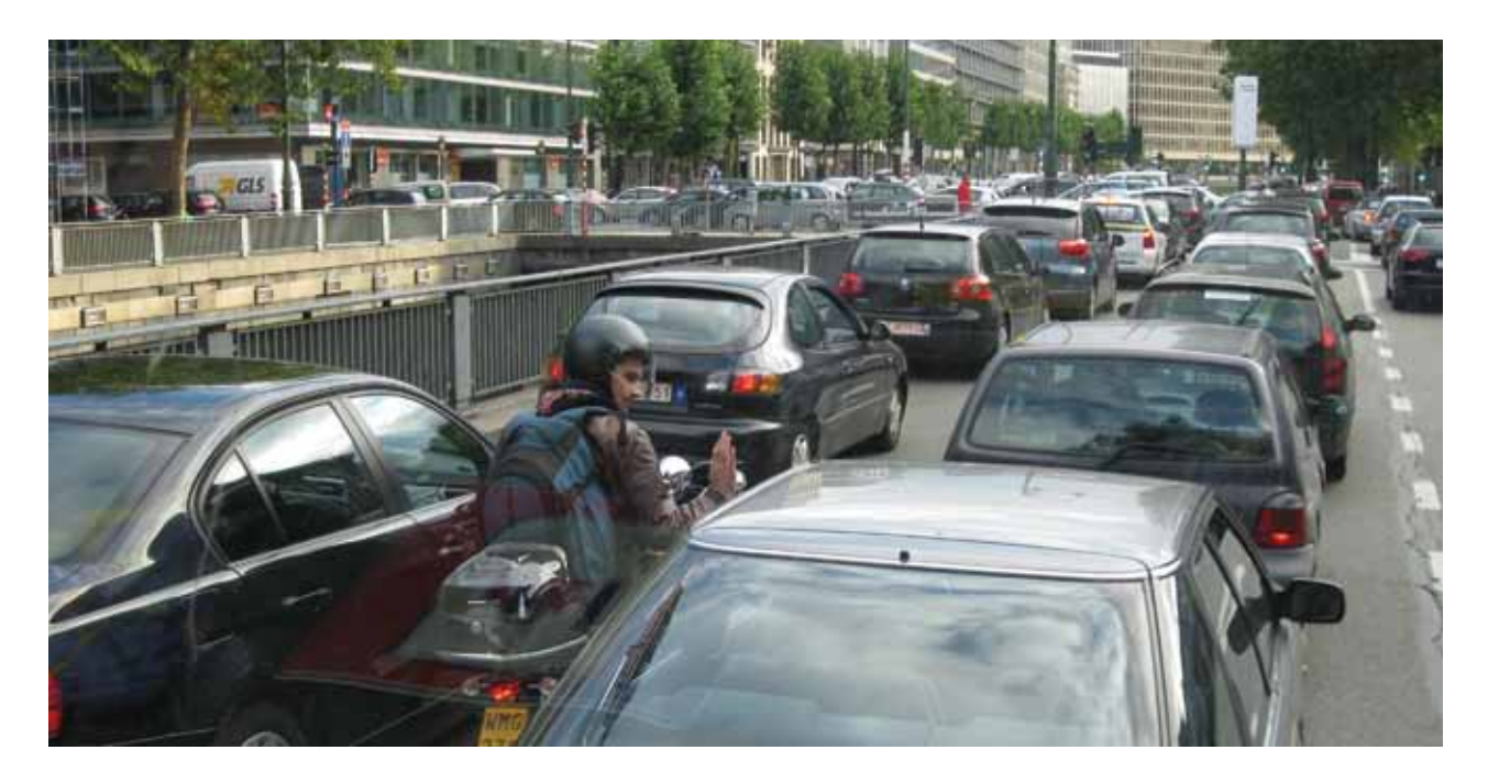
Figure 2. A scooter rider filtering through urban traffic in Brussels.

cle parking areas on surface lots, and allowing multiple PTWs in a single automobile parking space.