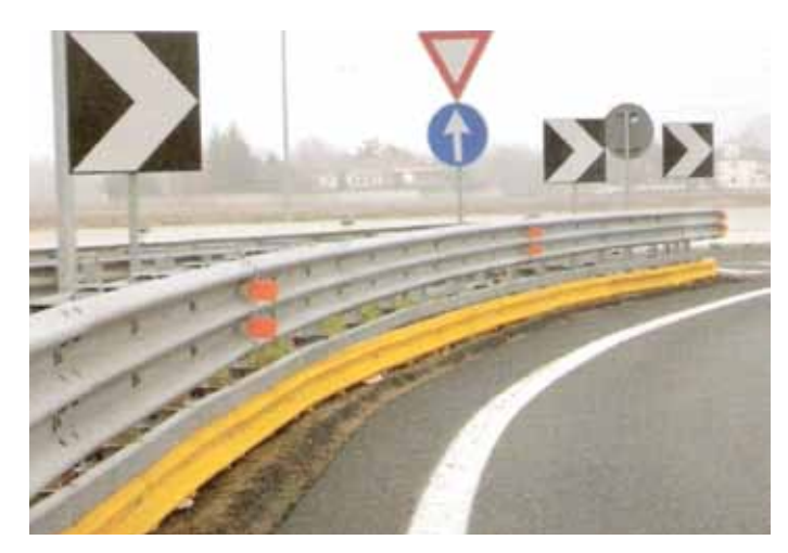
Figure 17. Spanish guardrail that meets motorcycle safety standards.