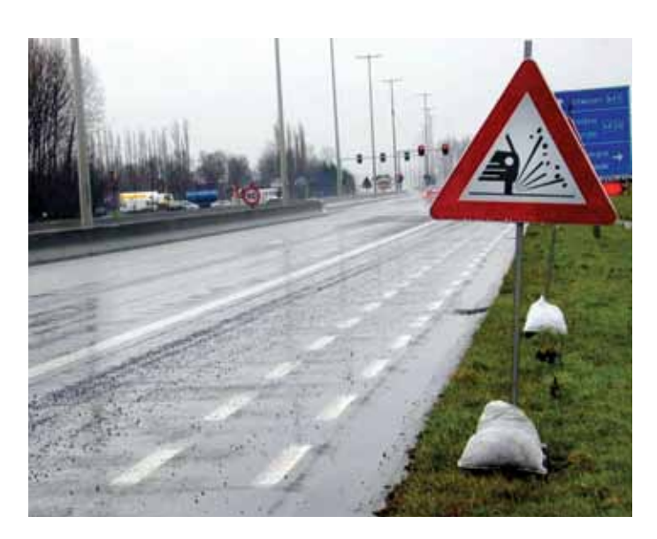
Figure 4. Splash warning sign in a work zone in Belgium.

Several agencies reported that sign post removal, either through consolidation of signs onto one post or relocation behind a barrier, was one strategy to provide a more forgiving roadside for motorcyclists. In several countries, the team observed lighter weight lattice sign posts, which were believed to be less of an injury threat to motorcyclists (see figure 7).