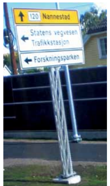
Figure 7. Lattice sign posts on a suburban arterial in Norway.