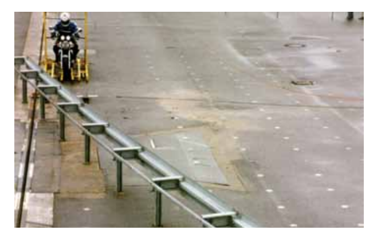
Figure 16. Upright motorcycle barrier impact test procedure.

as a crash black spot, open-graded asphalt mixes may be laid in that location. In England, high-friction surfaces were used at intersections. Some agencies had specifications limiting both the differential between adjacent pavement types and between the pavement and road markings because that differential causes grip problems for motorcycles.