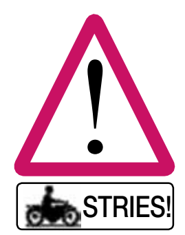
Figure 3. Work zone caution sign in Belgium with supplemental motorcycle plaque warning of grooved pavement (stries = striations).

benefit to motorcyclists because of their relative vulnerability to injury compared to automobile passengers. For instance, the Norwegian maintenance handbook has sections on clearing roadside obstructions that pose crash hazards and limit sight distance. This practice helps all road users, but can particularly benefit motorcyclists. Two unique maintenance practices organized by stakeholder groups were presented that could be adopted in the United States. One was a "road quality ride" organized by a rider group in Belgium, during which local motorcycle clubs ride together on a specific road to inspect and report on pavement quality and pick up debris and litter on the shoulder. The other was a roadway condition reporting system, either phone- or Web-based, aimed specifically at motorcyclists. Implementation of these systems varied from country to country. In Norway, for example, the Motorcyclists Union maintained a reporting