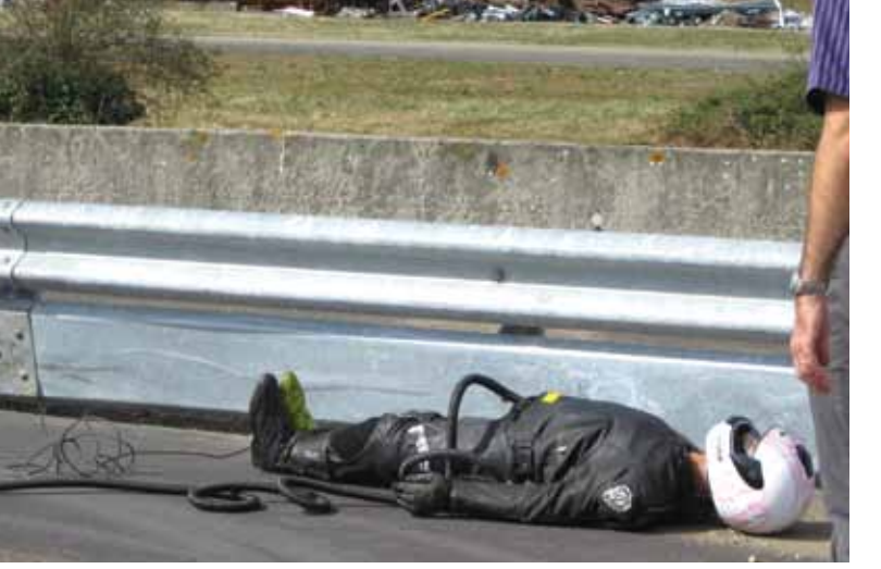
Figure 14. Motorcycle barrier and crash test dummy at LIER in Lyon, France.

These motorcycle-friendly barrier designs have been installed widely in some countries and in a limited way in other areas. France was conducting a large beforeand-after crash outcome analysis of its installed barriers, which was expected to be completed in 2012. Spain conducted a crash-causation study in 2007 that included some analysis of guardrail crash types.<sup>9</sup> An earlier European Union-sponsored study on advanced protec-