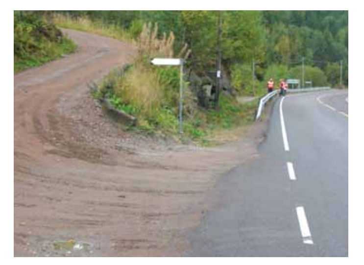
Figure 5. Before: gravel and dirt from side of road washed onto paved roadway.