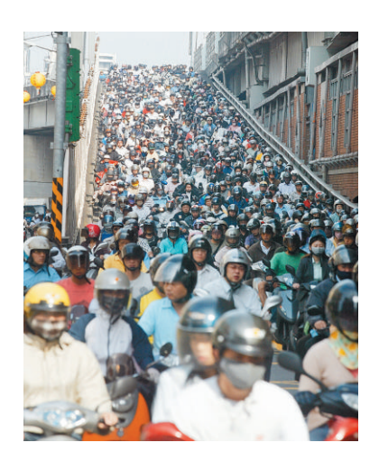
FIGURE 1: Rush hour motorcycle traffic in Taipei.

injuries, controversy still exists on the effect of helmet on CSI [7–10]. Crompton et al. (2011) utilized a large-scale study and concluded that motorcycle riders wearing helmets are less likely to suffer from CSI [11]. However, Crompton's study was not specific for HI patients and also admitted that the lack of helmet-type data was one of the limitations.